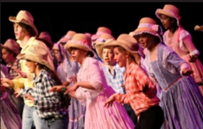
Photo highlights from the 2008 Broadway Chorus end of year performances

Chicago begins in Brisbane on 19 March. Following the Brisbane season it will open in Sydney from 14 May with other cities to follow.